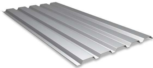
Figure 1 SAB 35/1035 wall and roof profile

The SAB 35/1035 profile is a trapezoidal profile and is illustrated in Figure 1. It often forms part of a built-up insulated wall cladding system where it is combined with a galvanised or pre-finished steel liner and mineral wool insulation, but can also be used for roofing applications.