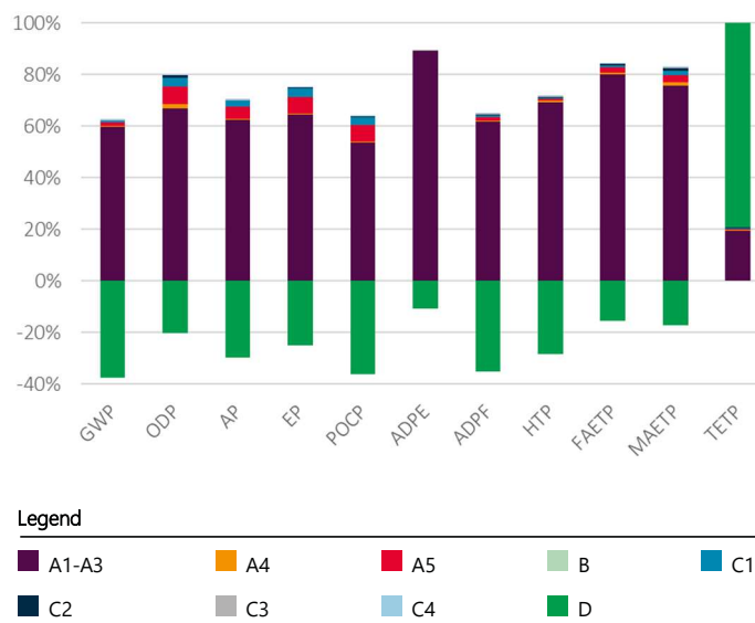
Figure 4 LCA results for the profiles

Module D values are largely derived using worldsteel's value of scrap methodology which is based upon many steel plants worldwide, including both BF/BOF and EAF steel production routes. At end-of-life, the recovered steel is modelled with a credit given as if it were re-melted in an Electric Arc Furnace and substituted by the same amount of steel produced in a Blast Furnace [23] . This contributes a significant reduction to all but one of the environmental impact category results, with the specific emissions that represent the burden in A1-A3, essentially the same as those responsible for the impact reductions in Module D.